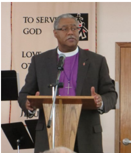
Bishop Julius Trimble