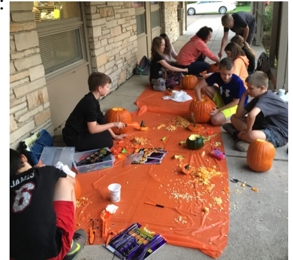
Jr. BLAST carving pumpkins for a fun fall activity!

We hope to see all of you at Jr. BLAST!!