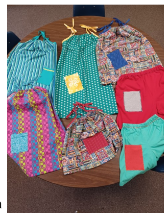
5 Little Dresses and 2 Little Britches were sewn at the Needlers sewing day in August.

Questions: Contact Diane Densmore, 515-270-1974 or Jody Rains, 515-278-8282.